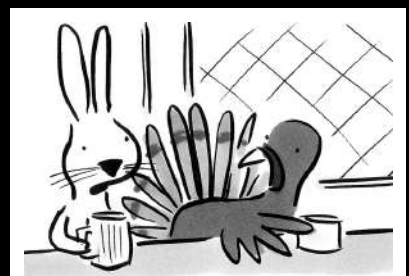
Take the groundhog - now that's a sweet gig."